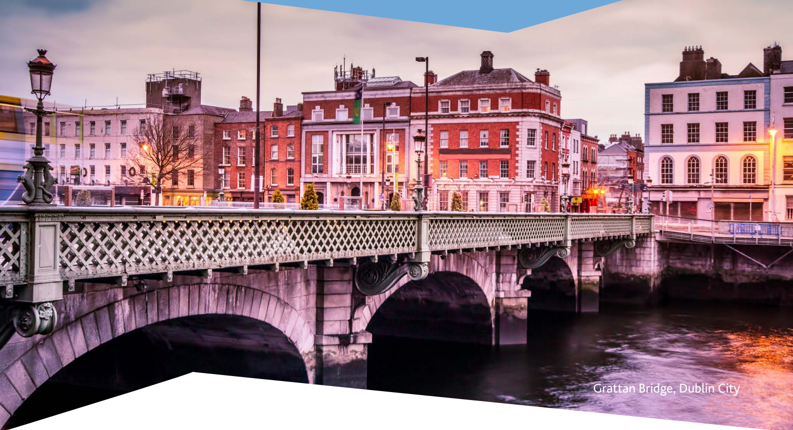
Grattan Bridge, Dublin City

Explore some of Dublin's coastal villages – Once you've experienced the bay it's time to head back to the city!